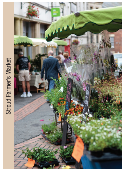
Stroud Farmer's Market